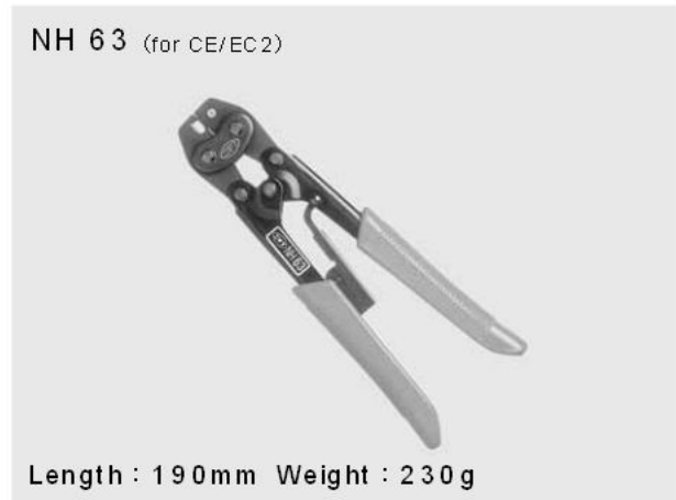
NH 63 (for CE/EC2)